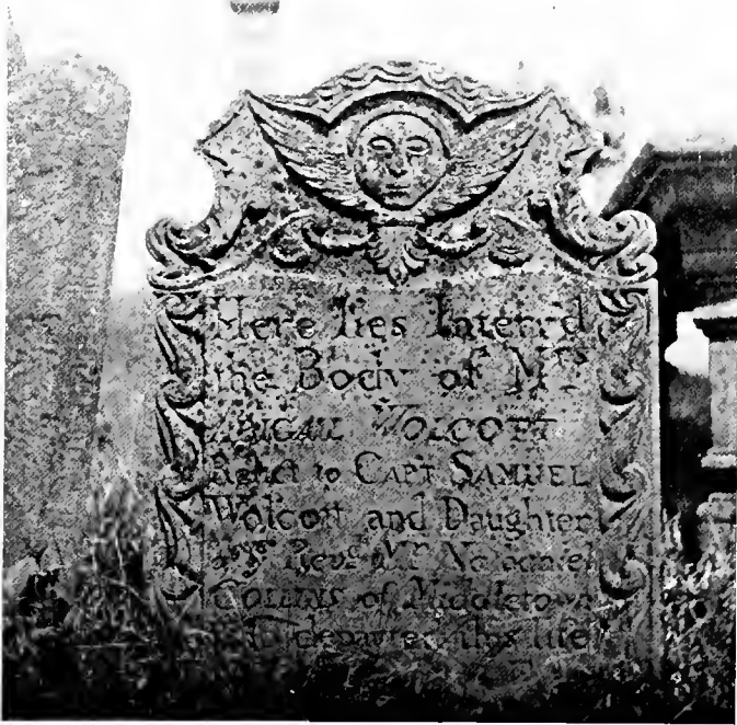
TOMBSTONE OF ABIGAIL (COLLINS) WOLCOTT.